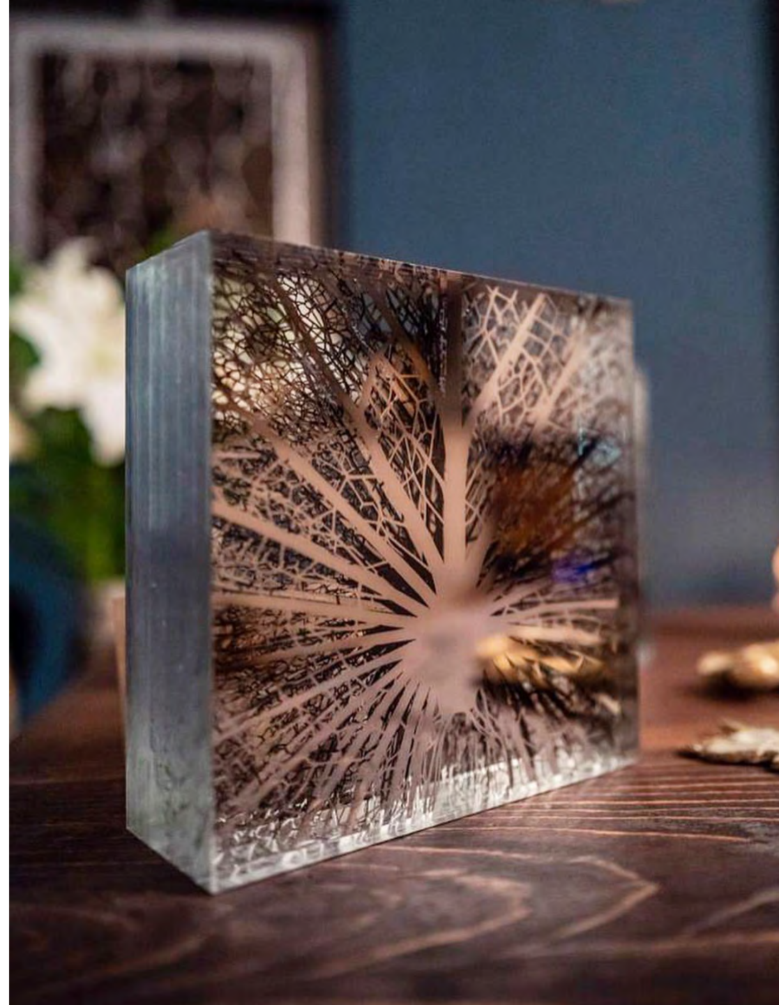
Image: example of 7-layered laminated glass, made by Mayer of Munich