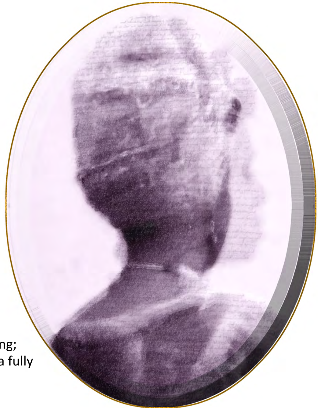
Image: preliminary text drawing; see next page for example of a fully rendered text drawing (for reference only).

The portrait would be rendered by layering text on several layers of glass. Additional coloring will be applied to achieve a jewel-like tone to the object. The glass will be laminated together to produce a solid object and cohesive image.